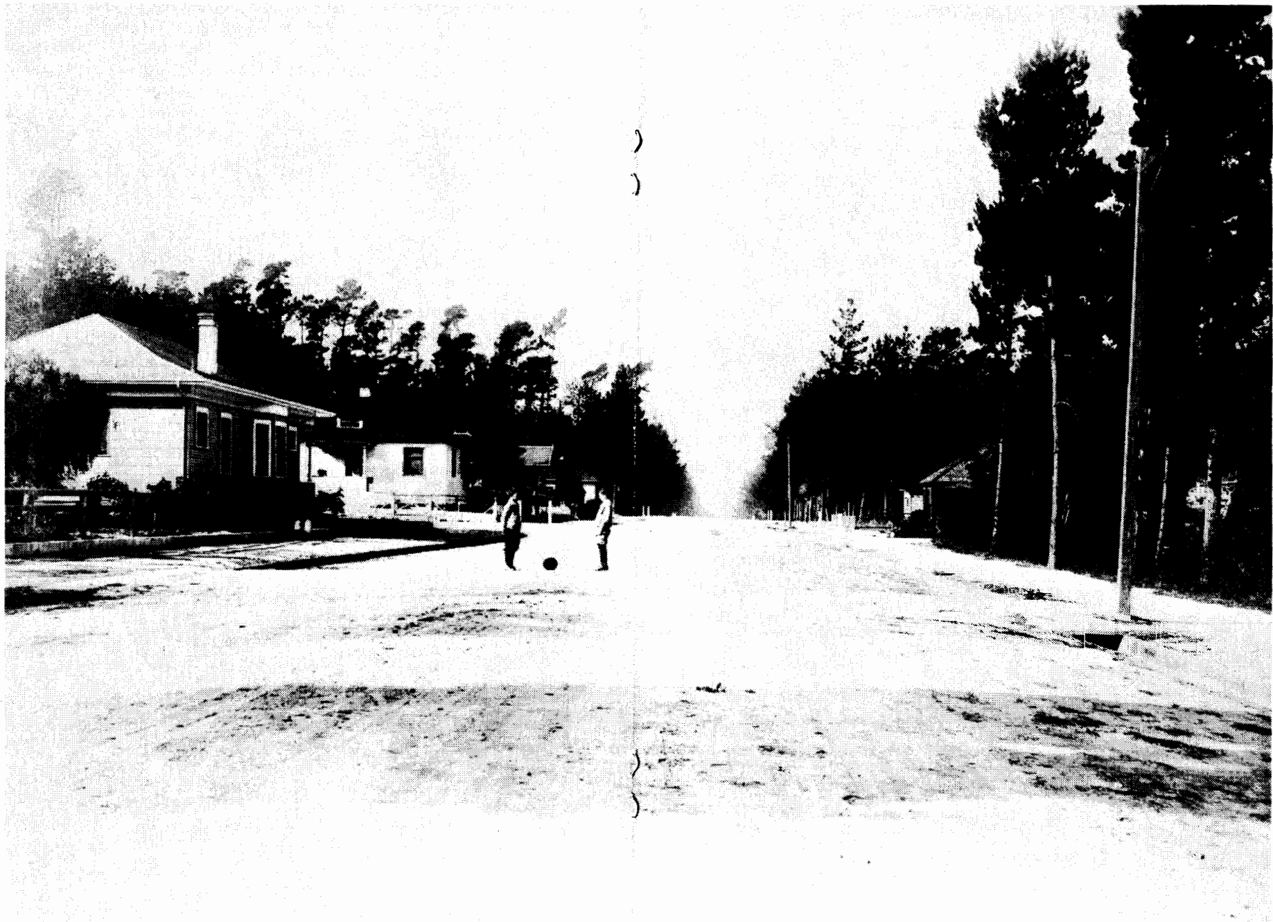
Looking west on unpaved Gibson near intersection with Congress, circa 1912. House at near left is 701 Congress (1909) and house across the street is 702 Congress.