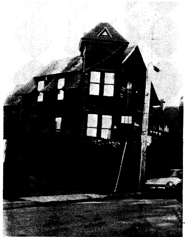
1979 photo of 107 12th Street. Notice board and batten replaced by horizontal siding and front porch enclosed.