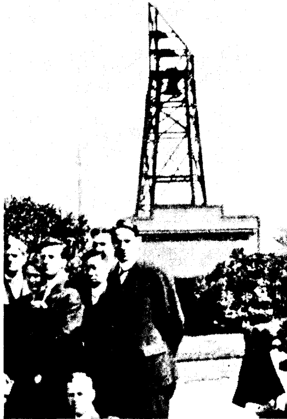
The original curfew bell at the first fire station circa 1890.

Christmas At The Inns - December 8, 1992