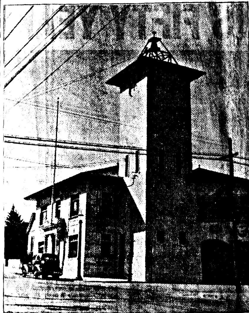
The historic old fire bell topping Pacific Grove's modern city hall was originally bought for $6, and was purchased in 1894, being moved to the present location in 1912. Before that time the firemen were called by a horn. The city has a volunteer department.