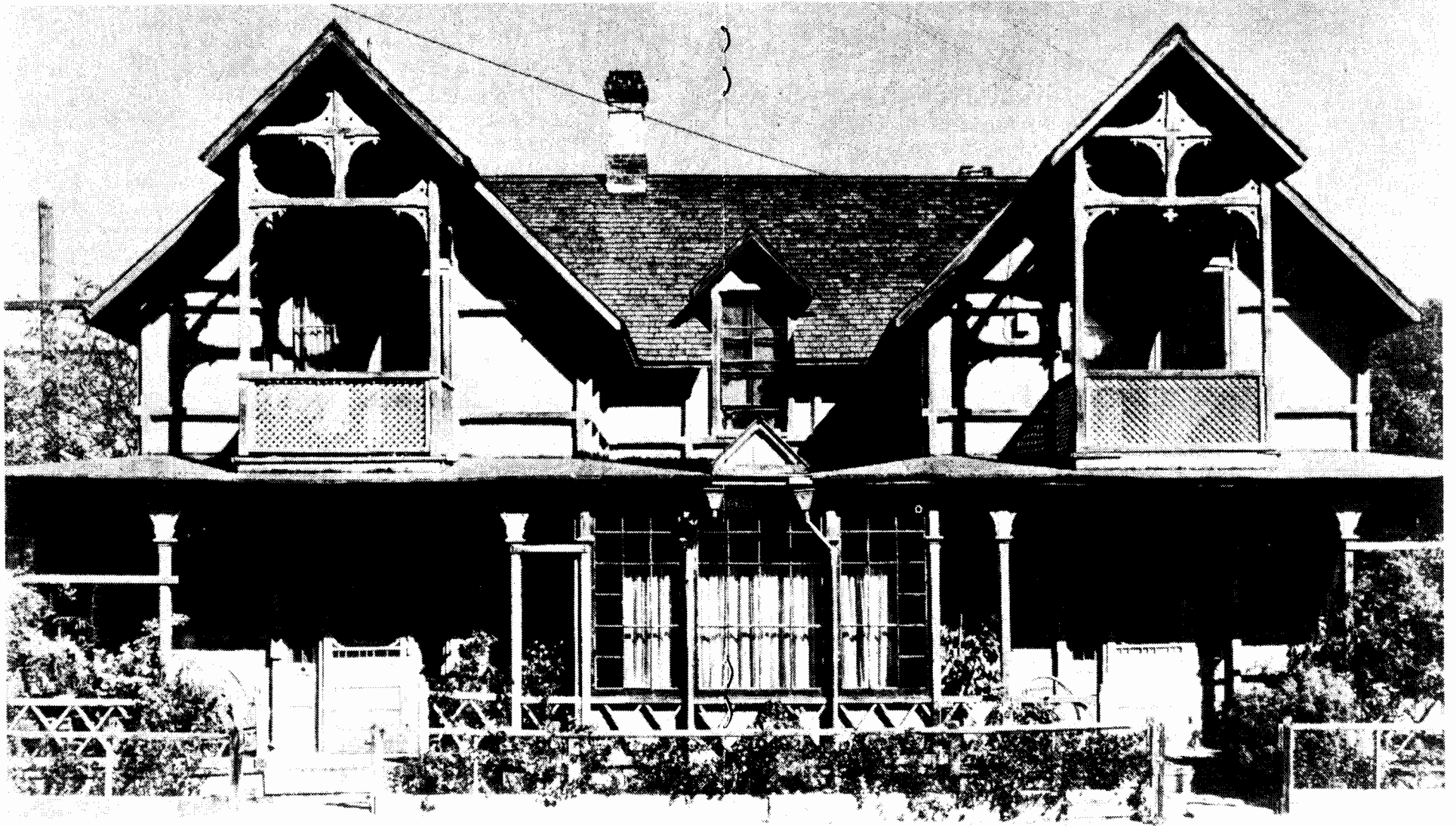
Built in 1879, demolished in the 1960s, Jewell Cottage remains one of our most asked about buildings.